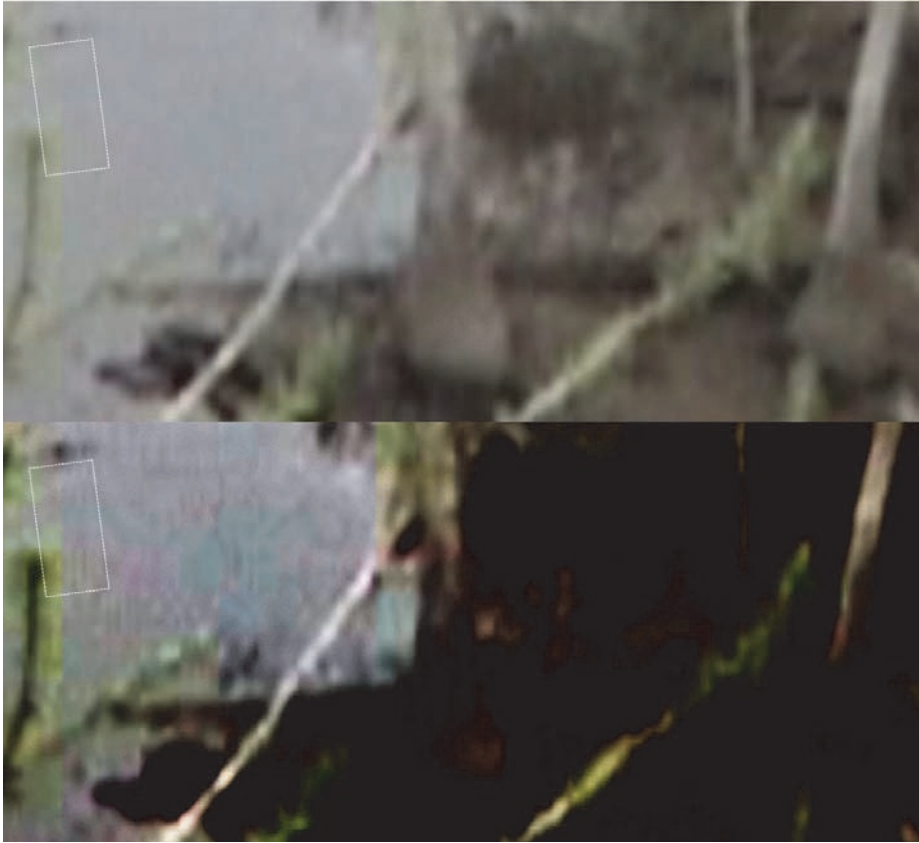
Fig. 9. Top: Similar to the bottom image in Fig. 8 but for a frame from the video in which the wings are nearly fully extended but poorly resolved. Bottom: It is clear that the wingspan exceeds 24 inches when the brightness and contrast are adjusted.

becomes apparent upon enhancing color, brightness, and contrast that the bird in the video has a black body and black leading edges on the dorsal surfaces of the wings, which are consistent with the Ivory-billed Woodpecker. A movie that documents that I was keeping watch out over the treetops and contains other context information (including an apparent double knock that is audible in the video shortly before the bird flew into view) is available at a data repository. 23