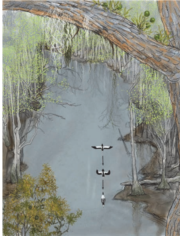
Fig. 5. Illustration of the view of the flyunder that appears in the 2008 video. 9 The two white stripes on the back and the black leading edges and white trailing edges on the wings were well seen from an ideal vantage point at close range and nearly directly above. The wings were folded closed in the middle of each upstroke. This diagnostic wing motion, which is well resolved in the video, is consistent with the two large woodpeckers but no other large bird (wingspan over 24 inches) of the region.

remain extended throughout the entire flap cycle, but the bird in the video clearly folds its wings closed in the middle of each upstroke. As illustrated in Movie S7 (which plays at half speed), the Pileated Woodpecker has a similar wing motion. Avian artists are very thorough in researching their subjects. In a series of paintings of the two large woodpeckers in flight by Zickefoose, 24 the wings of the Pileated Woodpecker are correctly shown folding closed in the middle of the upstroke; in an accurate representation of conventional wisdom at the time, the wings of the Ivory-billed Woodpecker are shown remaining extended throughout the flap cycle. The paradox was resolved after discovering that a photo from the 1930s shows an Ivory-billed Woodpecker in flight at an instant when the wings were nearly folded closed. 7 Accounts of a duck-like flight evidently pertained to the flight itself rather than the wing motion.