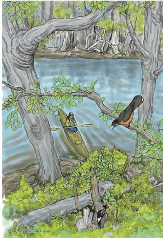
Fig. 1. Artistic recreation by Michael DiGiorgio of an encounter with two Ivory-billed Woodpeckers in the Pearl River swamp. 9 Kent calls from one of the birds was coming from behind a fallen tree as I waited for it to move into view. An American Robin ( Turdus migratorius ) was scolding from above. Moments later, kent calls started coming from behind me on the opposite side of the bayou.

and quickly flew into cover (with deep and rapid wingbeats consistent with an account by Tanner). On February 17, an Ivory-billed Woodpecker glided low across the bayou on fixed wings (in a flight consistent with an account by Audubon) and provided an excellent view across the dorsal surfaces of the wings. On February 18, I heard kent calls coming from behind a fallen tree on the bank. While I waited for an opportunity to obtain a photo as illustrated in Fig. 1, kent calls started coming from another bird on the opposite side of the bayou behind me. After the second bird apparently saw me near the first bird, there were a few harsh scolding calls from that direction and then a series of high-pitched calls. At the same location on February 20, I came upon an Ivory-billed Woodpecker that was perched before flushing into the woods. The same high-pitched calls then began coming from that direction. After ten minutes of tracking the movements of the high-pitched calls, I detected motion deep in the woods at a distance that was later determined to be 128 m from my observation position. I never managed to find the bird within the clutter of vegetation, but I managed to capture video footage of a large woodpecker that was perched, took two flights, and engaged in other behaviors.