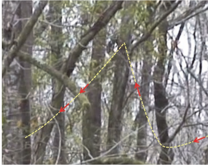
Fig. 11. Illustration of two successive swooping flights at 3:18 in the 2007 video. The exact flight paths are unknown, but the arrows indicate points at which the bird and its direction of flight are visible through gaps in the vegetation.

is relaxed at the end of the acceleration. As would be expected for a distant bird, there is a brief delay between when the flight maneuver occurs and when the sounds are audible. If the sounds do indeed come from the wings, they could be the result of a rather unique combination of characteristics and behaviors of the Ivory-billed Woodpecker, which includes high flight speed, high mass, narrow wings, “magnificent” swooping flights, 15 and “stiff and hard” wing feathers. 2 Similar spring-like sounds are faintly audible at 1:07 (Movie S27), 3:06 (six seconds after a downward swooping takeoff that begins in the lower center of the picture in Movie S28), 9:29 (Movie S29), and 17:57 (25 seconds into Movie S18 just before the woodpecker in the double knock event comes into view while climbing).