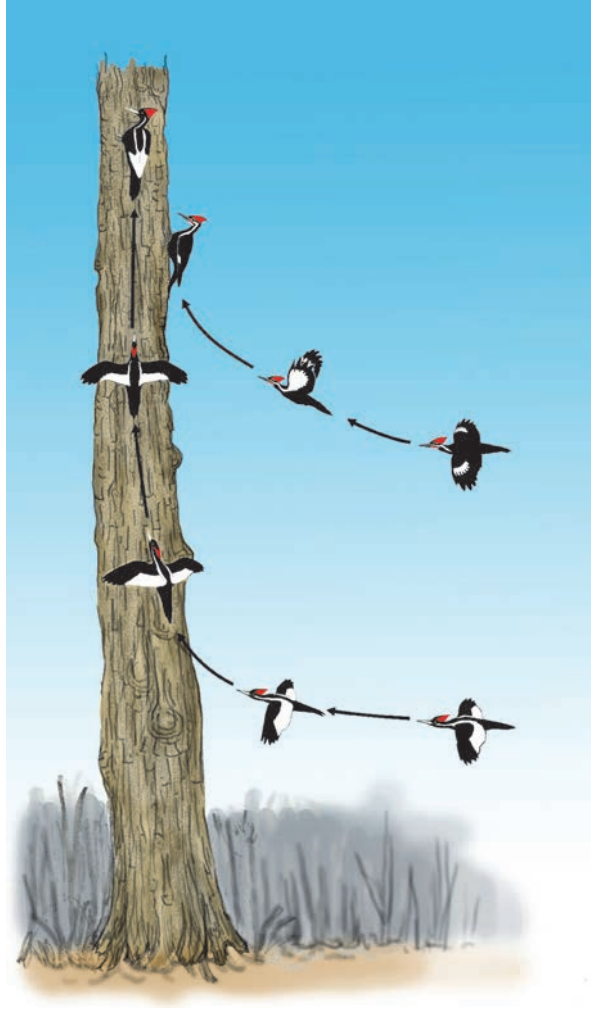
Fig. 10. Illustration by Michael DiGiorgio that compares upward swooping landings by Pileated and Ivory-billed Woodpeckers. 9

The Ivory-billed Woodpecker is the only woodpecker north of the Rio Grande that signals with double knocks. There do not appear to be any historical accounts of the type of flight that follows the double knock, but the burst of rapid and powerful wingbeats that made it possible to rapidly accelerate and swoop upward just after taking off is consistent with the Ivory-billed Woodpecker. The “stiff and hard” wing feathers that Tanner 2 described may be an adaptation for such flights. In addition to the double knock and the upward swooping flight, there were two other behaviors that do not seem to be consistent with any species other than the Ivory-billed Woodpecker. As discussed in Movie S19, the bird in the video repeatedly ‘flirts’ its wings, a frequent behavior of the Ivory-billed Woodpecker according to Tanner, 2 while moving from right to left. It would make sense that a massive woodpecker would frequently use its wings for balance while moving around in a tree, and