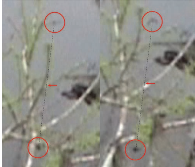
Fig. 6. Frames from the 2008 that were used to estimate the wingspan. The circles mark the locations of the bird and its reflection. The arrows indicate the approximate locations of the projection of the bird onto the surface of the bayou. Left: The wings are fully extended but poorly resolved. Right: The wings are well resolved but only partially extended. The lines between the images are vertical, but the video camera was not held perfectly level.

bird and its reflection. On March 30, 2010, Tommy Tuma and Wayne Higginbotham of the Louisiana Department of Wildlife and Fisheries assisted in obtaining a reference photo for estimating the wingspan. Some of the details of how the estimate was obtained using a 24-inch reference object are provided in Document S1. The size of the reference object is greater than the wingspan of the Belted Kingfisher ( Megaceryle alcyon ), which is the third largest (in terms of wingspan) bird of the region (behind the two large woodpeckers) that does not keep its wings extended throughout the flap cycle. As shown in Fig. 7, the reference object was held near where the bird flew past trees that were used to scale the reference photo relative to frames from the video.