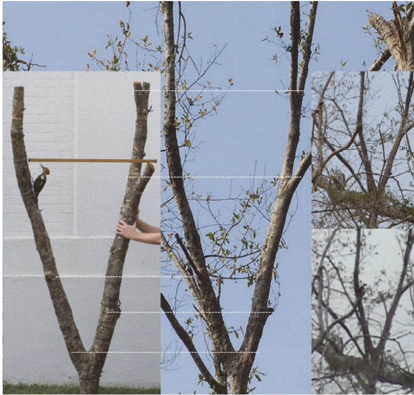
Fig. 2. Comparison of the tree specimen with an image from the 2006 video and photos that were obtained shortly after the video was obtained. The photo in the center was scaled horizontally and vertically by slightly different amounts to compensate for the fact that it was obtained from a closer vantage point at an angle looking slightly upward. The dashed lines indicate forks and other features that line up.

A size comparison became possible after the perch tree blew down and part of it was collected in 2008. The tree specimen was cut to include forks that facilitated scaling. It can be difficult to recognize a tree when there is even a small change in the viewing angle, but it is clear from the photos in Fig. 2 that the tree specimen was cut from the perch tree. The Ivory-billed Woodpecker is one of the largest woodpeckers in the world. Size parameters that may be appropriate for comparison in images include length (from tip of bill to tip of tail) and body size (cross-sectional dimensions). The length of the Ivory-billed Woodpecker ranges up to 51 cm, with averages of 45.4 cm for fifteen adult males and 47.1 cm for eleven adult females. 2 There do not appear to be any published data on body size, but ranges have been published for body mass and the dimensions of openings to nest cavities, which are closely related to body size (excessively large cavity entrances allow easier access to predators). The smallest Ivory-billed Woodpeckers are more massive than the largest Pileated Woodpeckers; 20,21 the smallest openings to Ivory-billed Woodpecker cavities are larger than the largest openings to Pileated Woodpecker cavities; 5 the fact that the ranges for these quantities are disjoint for the two large woodpeckers suggests that the ranges for body size are also disjoint for these species.