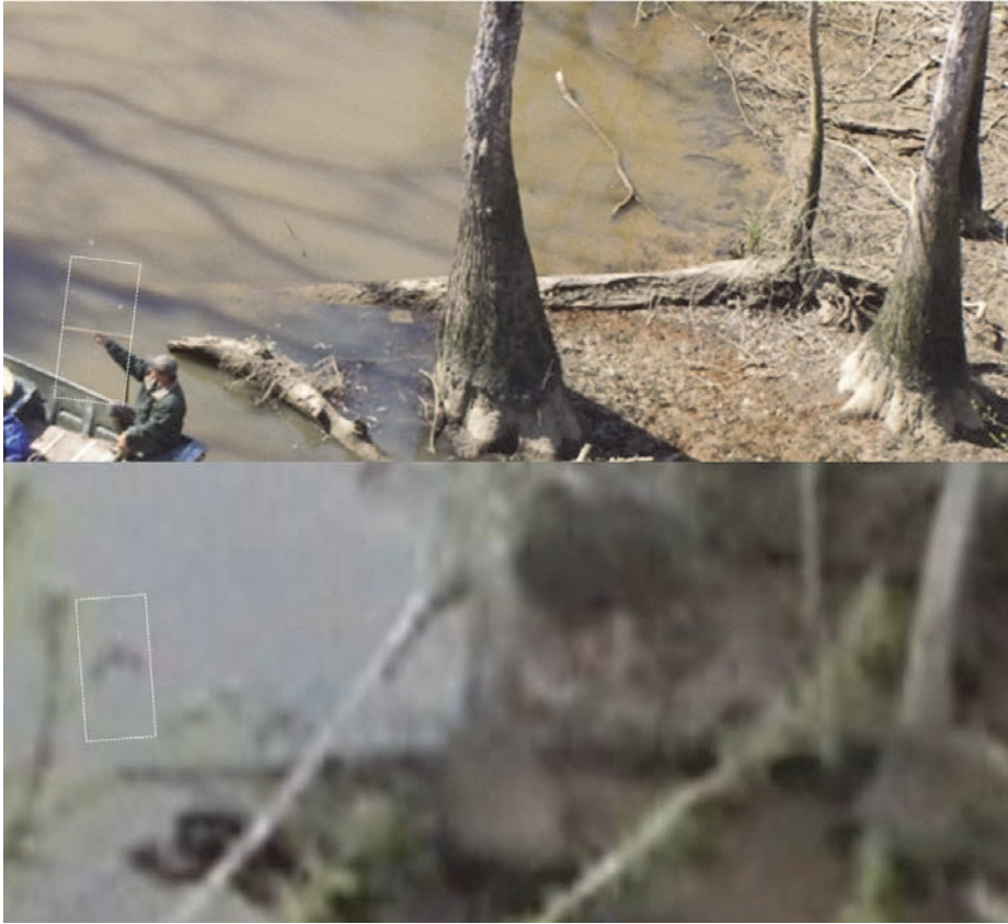
Fig. 8. Top: The width of the white rectangle is the same as the length of the reference object. Bottom: The rectangle has been copied without changing its size onto an image from the video in which the wings were only partially open; this image was scaled using objects that appear in the video. Small tree branches that appear in the foreground in the lower image were removed to obtain the reference photo.

stooping flights, and others. For the case of cruising flight, flap rate is amenable to statistical analysis, and the standard deviation is typically less than ten percent of the mean. 25–27 The large woodpecker in the 2008 video was in cruising flight. Only two large woodpeckers exist in the region, but the flap rate of the bird in the video is about ten standard deviations greater than the mean flap rate of the Pileated Woodpecker. 7 These facts are sufficient to rule out all species except the Ivory-billed Woodpecker. Several additional characteristics and behaviors are consistent with that species but not the Pileated Woodpecker.